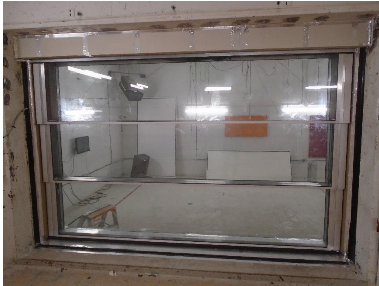
Figure 1: Wall Specimen

Proprietary details of the specimen are withheld from this report at the request of the client.